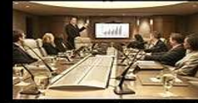
What my parents think I do.