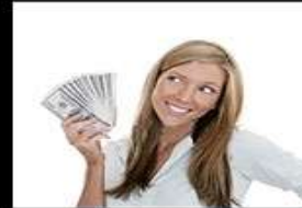
What my friends think I do.