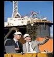
What I actually do.