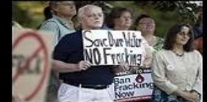
What the land owners think I do.