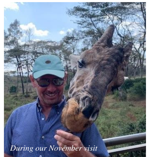
During our November visit