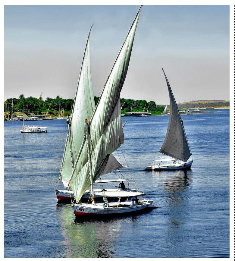
12 Days • 12 Meals : 10 Breakfasts, 4 Lunches, 7 Dinners

HIGHLIGHTS... Cairo, Grand Egyptian Museum, Luxor, Temple of Karnak, Valley of the Kings, Deluxe 4-Night Nile River Cruise, Queen Hatshepsut Temple, Kom Ombo, Aswan, Philae Temple Sound & Light Show, Historic Cairo, Khan el-Khalili Bazaar, Giza, Pyramids, Sphinx, Choice on Tour