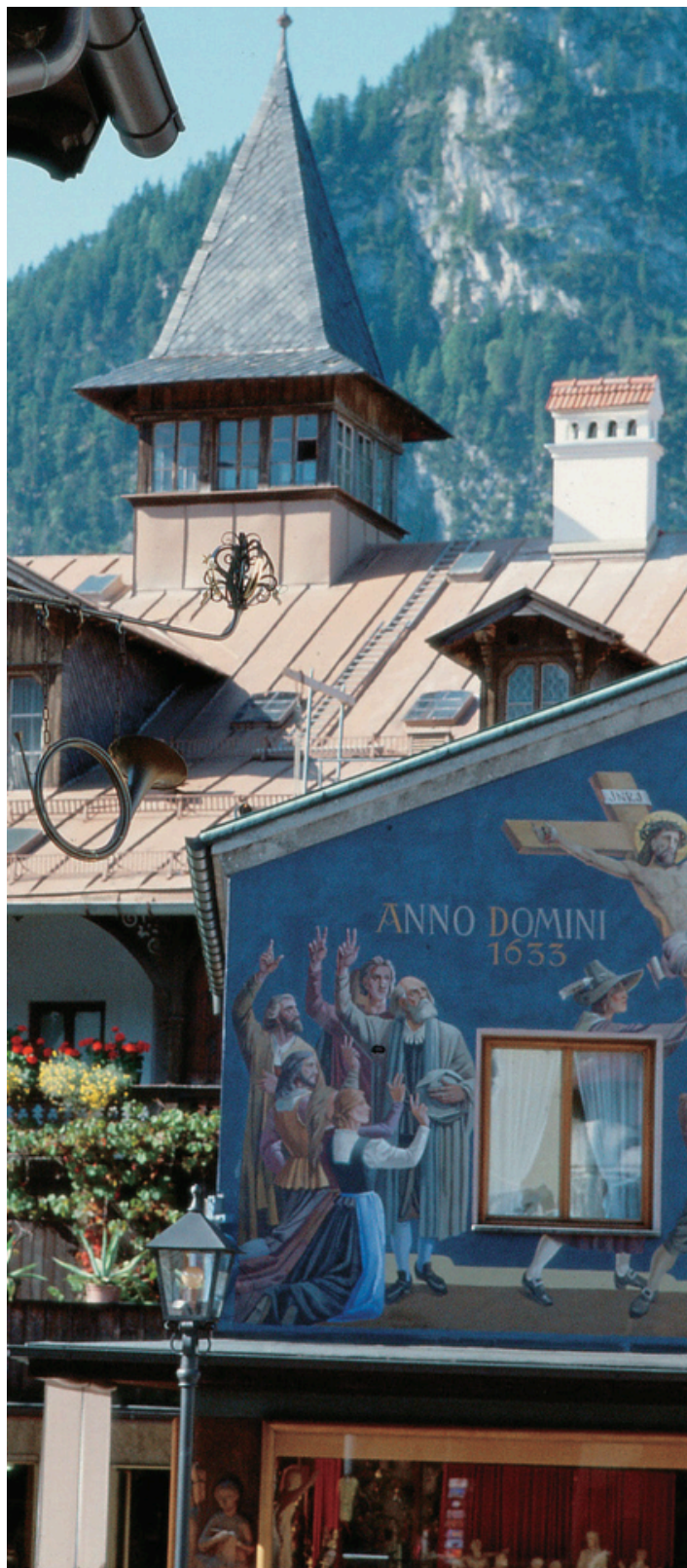
Houses, Oberammergau