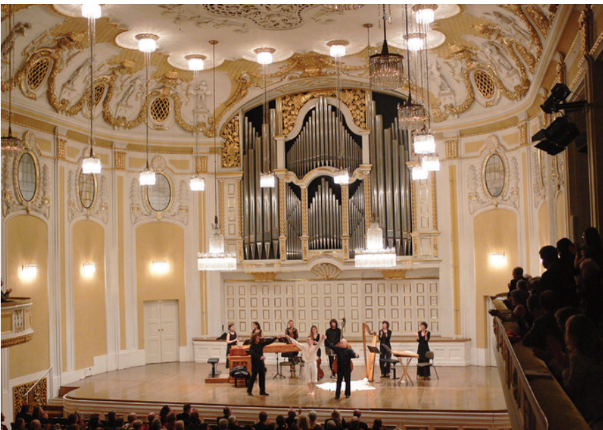
Salzburg's Mozarteum