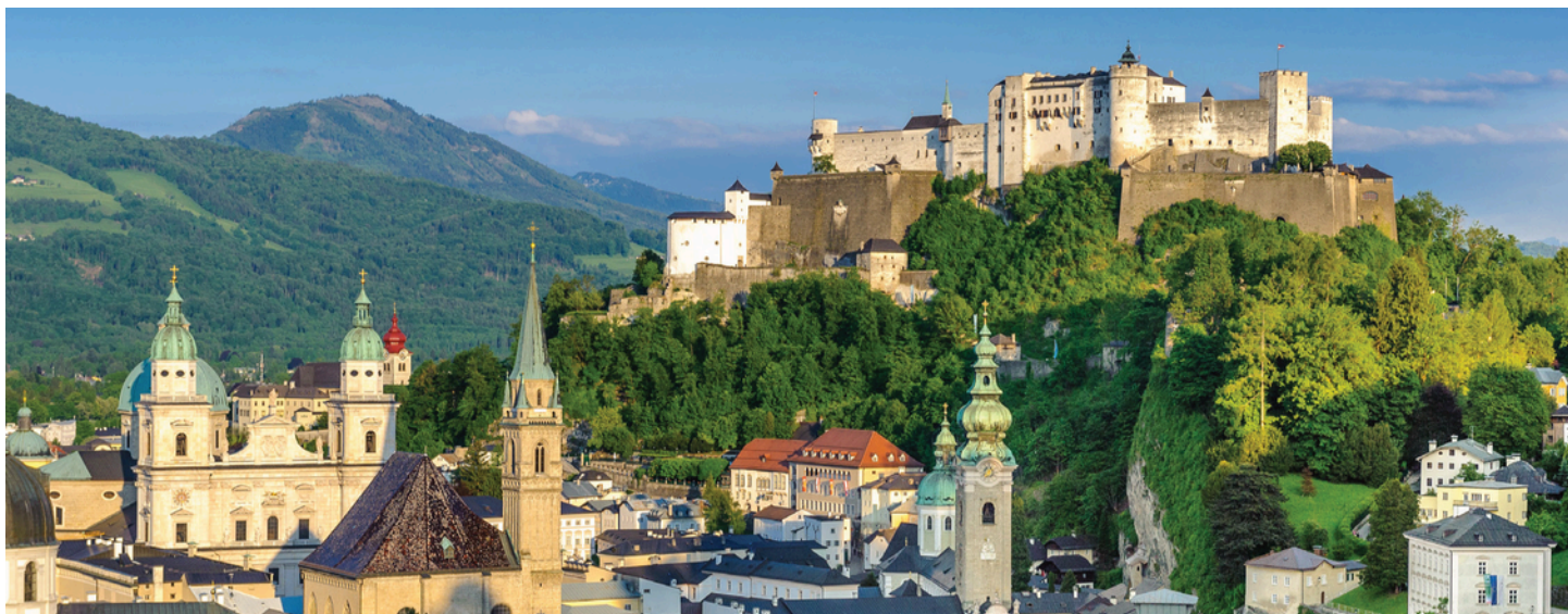
Fortress Hohensalzburg and the Old Town of Salzburg

Enjoy a guided tour of Salzburg, Mozart's hometown. In the afternoon, visit the lakeside village of Mondsee and picturesque