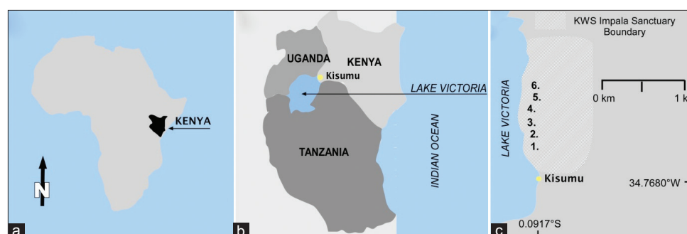
Figure-1: (a) Location map of Kenya in Africa. (b) Location map of Kenya in relationship to Lake Victoria. (c) Site map of the sample sites within the Kenyan Wildlife Service Impala Sanctuary, Kisumu, Kenya.