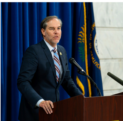
$100,000 TAKE THE LEAD GRANTS FOR KY CHAMBERS OF COMMERCE