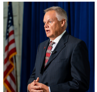
SCALING THE INTERALLIANCE MODEL OF TALENT PIPELINE DEVELOPMENT