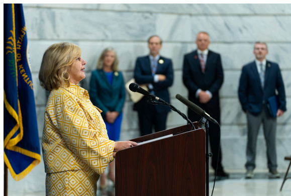
RECRUITING 300 NEW STUDENTS FOR 2025-2026 SCHOOL YEAR