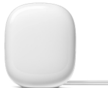
Nest Wifi Pro

No data caps. No installation fees. No equipment fees.