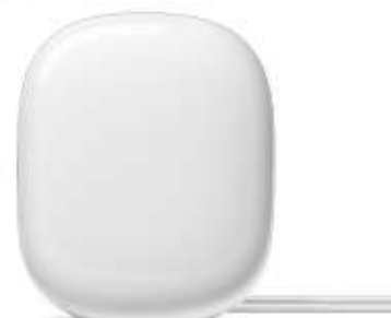
Nest Wifi Pro

No data caps. No installation fees. No equipment fees.