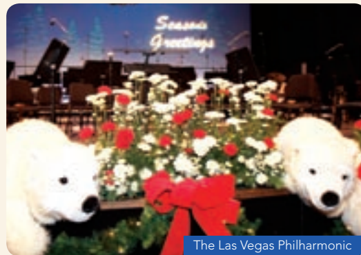
The Las Vegas Philharmonic