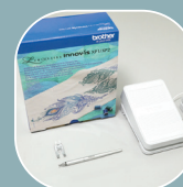
LUMINAIRE INNOV-IS XP3 - UPGRADE KIT XP3 SERIES SAVRXPUGK3