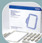
LUMINAIRE XP MAGNETIC SASH FRAME SAMS360