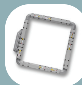
LUMINAIRE XP MAGNETIC FRAME 10" X 10" SAMS254