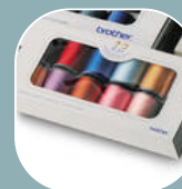
12-COLOUR EMBROIDERY THREAD SET SAETTS