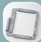
MAGNETIC SASH FRAME (5"X7") SAMF180