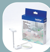
MAGNIFYING LENS SAML