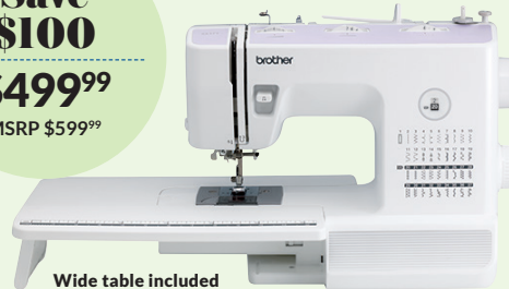
Wide table included