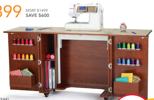
K8205 (TEAK) Bandicoot II