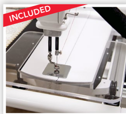
16" RULER BASE