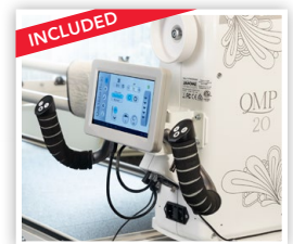
ADJUSTABLE REAR HANDLEBARS WITH PANTOGRAPH LIGHT