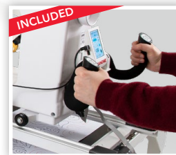
REAR HANDLEBARS WITH PANTOGRAPH LIGHT