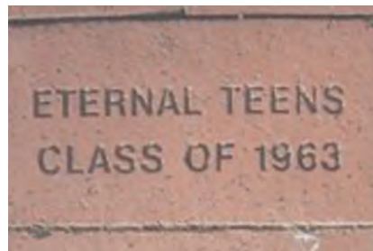
$75.00 - Commemorative Brick Installed at Lincoln High School

Please note some items may not be available if you live outside the Des Moines area.