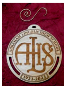
$15.00 - ALHS 100th Anniversary Cherry Wood Ornament with gold tone Hook (3 1/4 x 3 1/4)