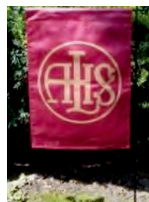
$20.00 - Garden Flag with Pole $15.00 - Garden Flag only (13 x 18)