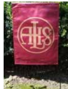
$20.00 - Garden Flag with Pole $15.00 -- Garden Flag only (13 x 18)