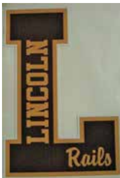
$5.00 - Lincoln Rails Window Sticker (for your car) (3 1/2 x 5)