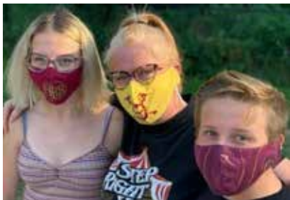
$8.00 - Mask Includes pocket for filter -- Maroon with ALHS logo, Gold with Abe Caricature, or Maroon/gold pattern.

Here is merchandise available for purchase. Please note some may not be available if you live outside the Des Moines area.