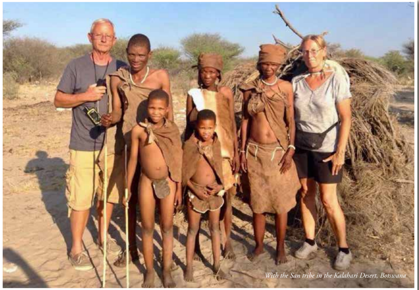
With the San tribe in the Kalahari Desert, Botswana