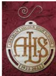
$15.00 - ALHS 100th Anniversary Cherry Wood Ornament with gold tone Hook (3 1/4 x 3 1/4)