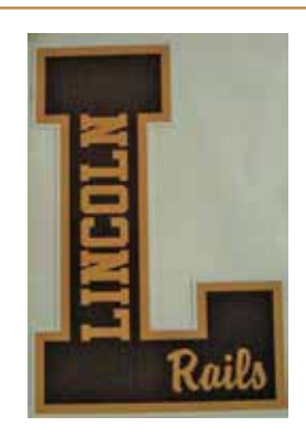
$5.00 - Lincoln Rails Window Sticker (for your car) (3 1/2 x 5)