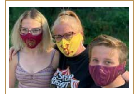
$8.00 - Mask Includes pocket for filter -- Maroon with ALHS logo, Gold with Abe Caricature, or Maroon/gold pattern.

Here is merchandise available for purchase. Please note some may not be available if you live outside the Des Moines area.