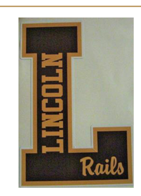
$5.00 - Lincoln Rails Window Sticker (for your car) (3 1/2 x 5)