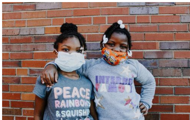
Photograph above, two elementary girls pictured outside The Bethlehem Center, Chattanooga.