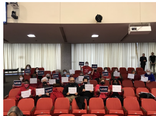
At the KCS Board meeting Feb 7, 2022