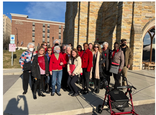
Gathered at Church Street United Methodist Church headed to the KCS Board meeting

Wear United Women in Faith red and take photos/be visible if the meeting is taped