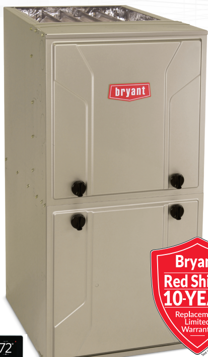
Model 987M Only 3

10-year parts and lifetime heat exchanger limited warranty when registered on time. 3 In addition, Model 987M offers the Red Shield™ 10-year unit replacement limited warranty (heat exchanger failure only) upon timely registration. 3