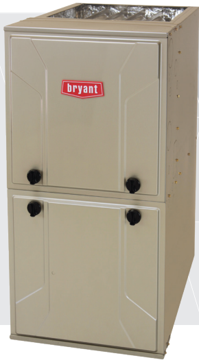
Model 987M and 986T