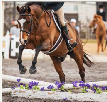
HUNTERS RIDGE CROSSRAIL MEDAL