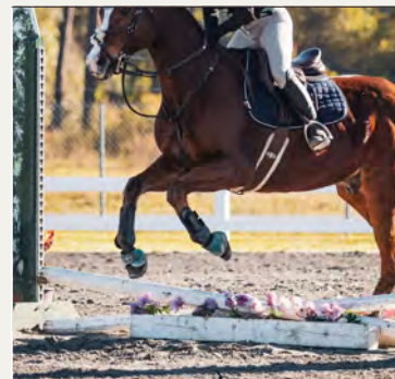
ARROWSMITH FAMILY JUMPER CLASSIC