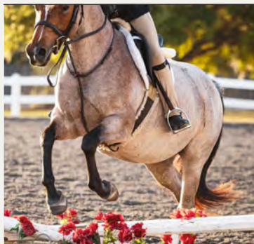
FALLING UP FARM HUNTER CLASSIC