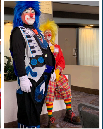
Great Lakes Clown Competition