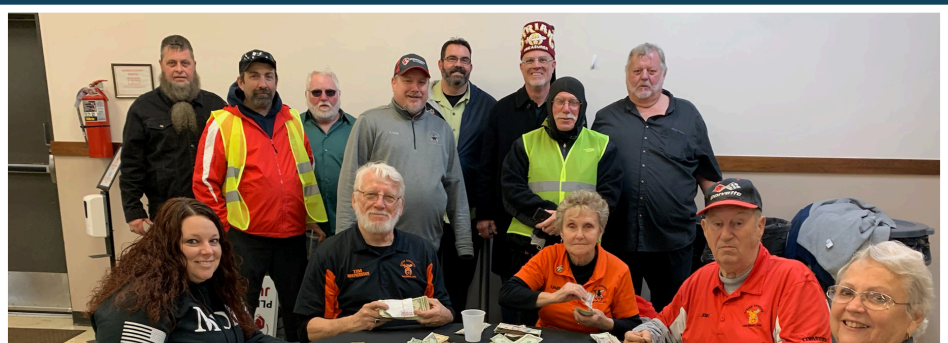
Shriners Hospital Road Block