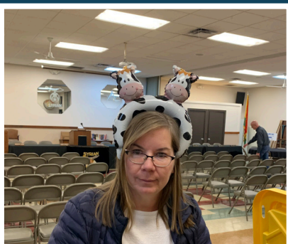
Setting Up for an Event