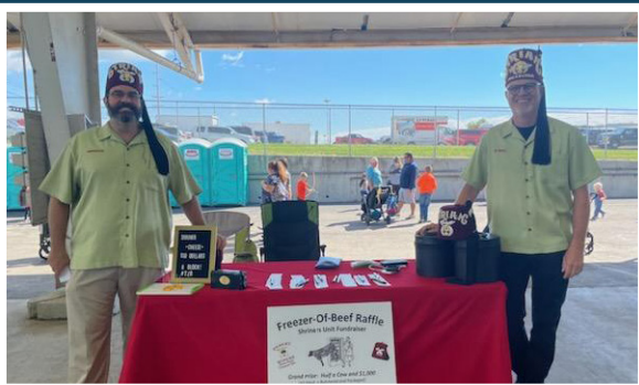
Freezer of Beef Raffle