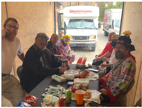
Before the Parade - Lunch Provided by the Potentate