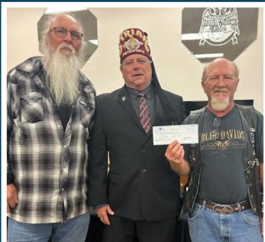
Bad Boys Donation