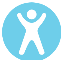
Amenities & Recreation