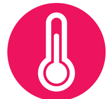
Response & Protocols