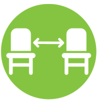
Meeting & Event Space