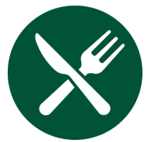
Banquet Food & Beverage