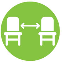
Meeting & Event Space