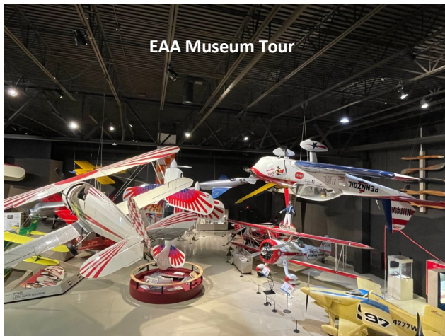
EAA Museum Tour