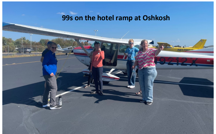
99s on the hotel ramp at Oshkosh