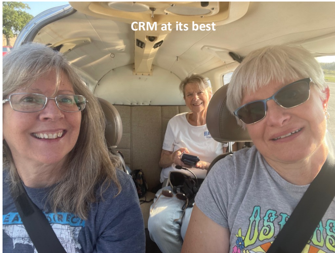
CRM at its best