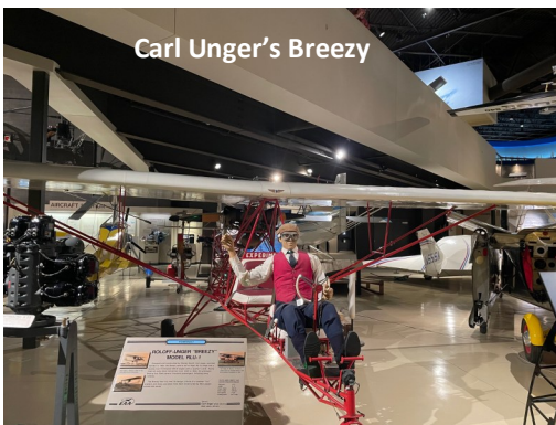
Carl Unger's Breezy