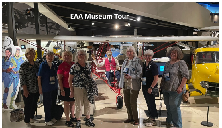
EAA Museum Tour