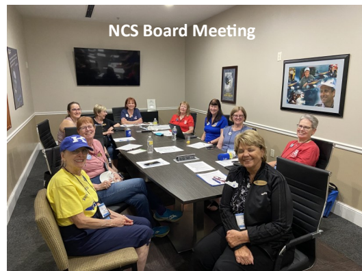
NCS Board Meeting