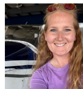
The day I got my PPL