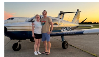
My husband & I with the Cherokee