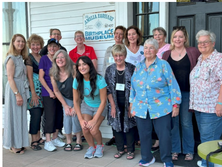
NCS 99s at the AEBM reception