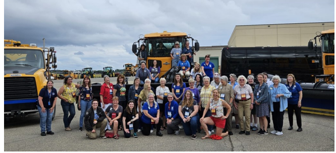
NCS Saturday pm MSP tour