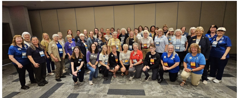
NCS Fall 2024 Business Meeting Group Photo