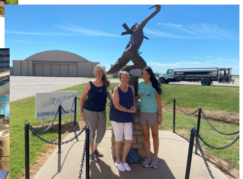
Chicago 99s after landing at STJ