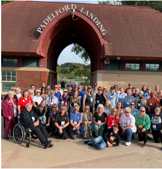
NCS Friday night dinner cruise