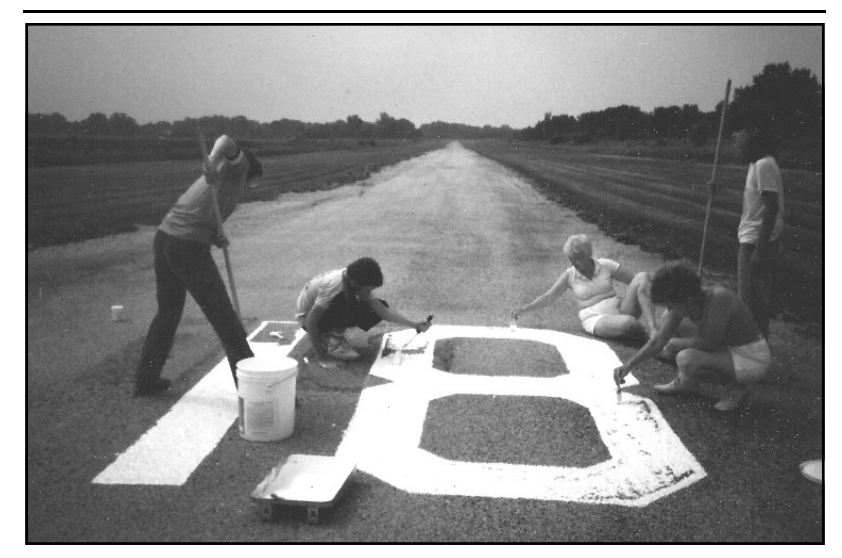
Chapter members paint runway numbers at Howell Airport, Crestwood, IL on June 20, 1987.