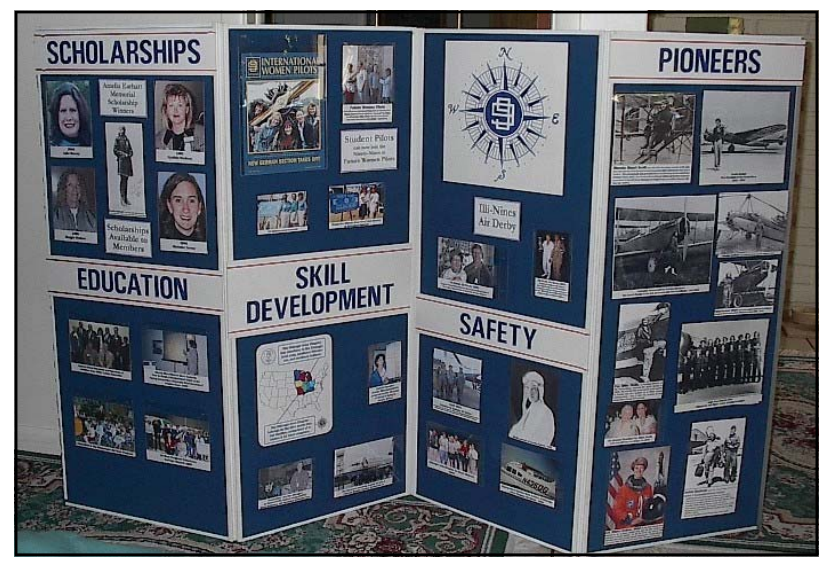
The Chicago Area Chapter display board

a strong network of volunteers dedicated to the mission of the Ninety-Nines, to promote world fellowship through flight, provide networking and scholarship opportunities for women and aviation education in the community, and to preserve the unique history of women in aviation. This chronological history of the Chapter is a testimony to their success in accomplishing that mission.