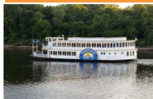
Sunset Dinner Cruises Padelford Riverboats Friday Night