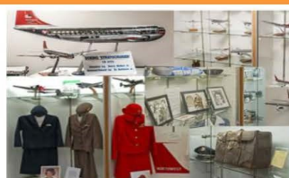
49 ½ Activity Northwest Airline History Center Saturday Morning