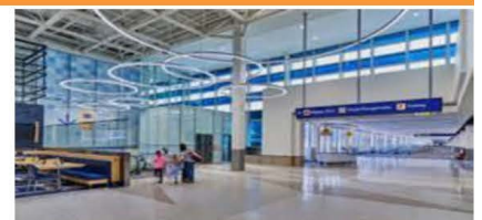
Behind the Scenes Tour Minneapolis (MSP) Airport “Best Airport in North America 2023” by Airports Council International Saturday Afternoon