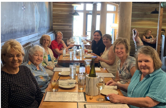
Left pic Double Birthday Party