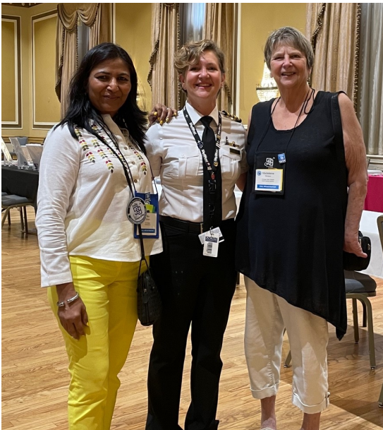
Right pic SWEARING IN New Officers, Directors and Trustees