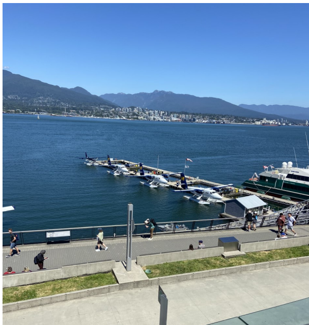
Harbor Air Seaplane rides for everyone!!!

We really need one of our photographers to come next year—Corie? Larisa? Mona? Eva? Buehler???