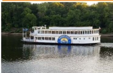
Sunset Dinner Cruises Padelford Riverboats Friday Night