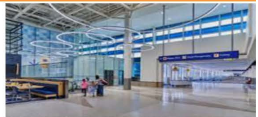
Behind the Scenes Tour Minneapolis (MSP) Airport "Best Airport in North America 2023" by Airports Council International Saturday Afternoon