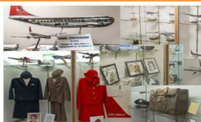
49 ½ Activity Northwest Airline History Center Saturday Morning