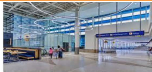
Behind the Scenes Tour Minneapolis (MSP) Airport "Best Airport in North America 2023" by Airports Council International Saturday Afternoon