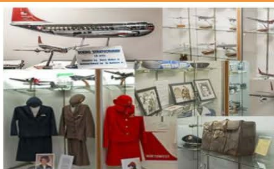
49 ½ Activity Northwest Airline History Center Saturday Morning