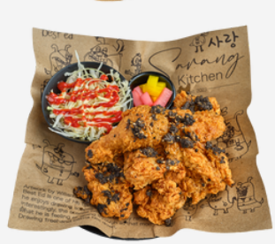
Good as Gold

House special soy sauce fermented with fruits mixed with special mayo sauce