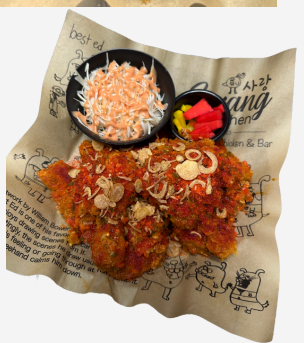
Sambal Oelek 🍠 🍠 🌶

Salted Egg Yolk sauce with chillies and curry leaves drizzled on fried chicken