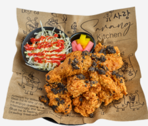
Good as Gold

House special soy sauce fermented with fruits mixed with special mayo sauce