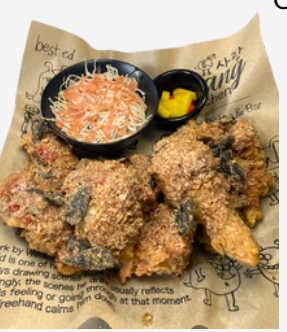
Golden lava sauce