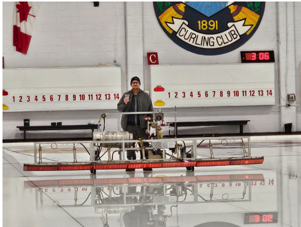
Mid Burn on Sheet B

Our pebble water is filtered: for sediment (x2), carbon filter, pushed through reverse osmosis and finally through a de-ionizing filter (<5ppm solids)....so it's good.