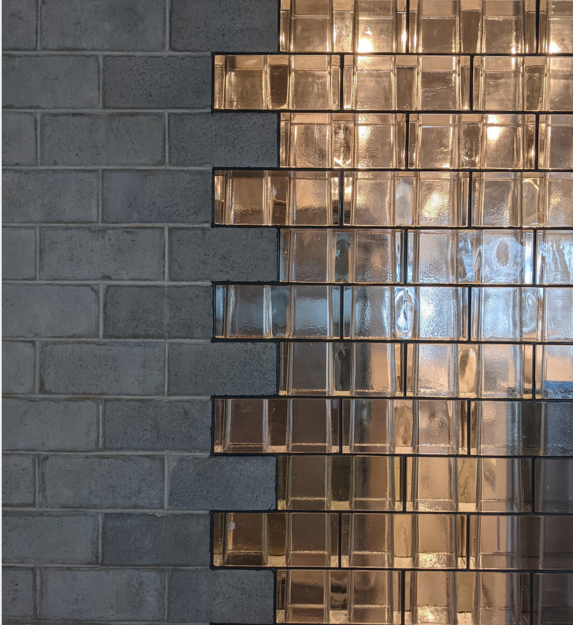
A CMU BLOCK WALL WAS DESIGNATED HISTORIC BY THE STATE HISTORIC PRESERVATION OFFICE. IN ORDER TO MAKE THE SPACE AMENABLE FOR THE CAFE PROGRAM, DS+R REIMAGINED THE CMU BLOCK, CASTING THE SAME SHAPE AND SIZE OF THE CMU IN GLASS, REFERENCING THE HISTORIC BUT REIMAGINING IT IN A WAY THAT ALLOWS LIGHT AND VIEWS TO ANIMATE THE SPACE