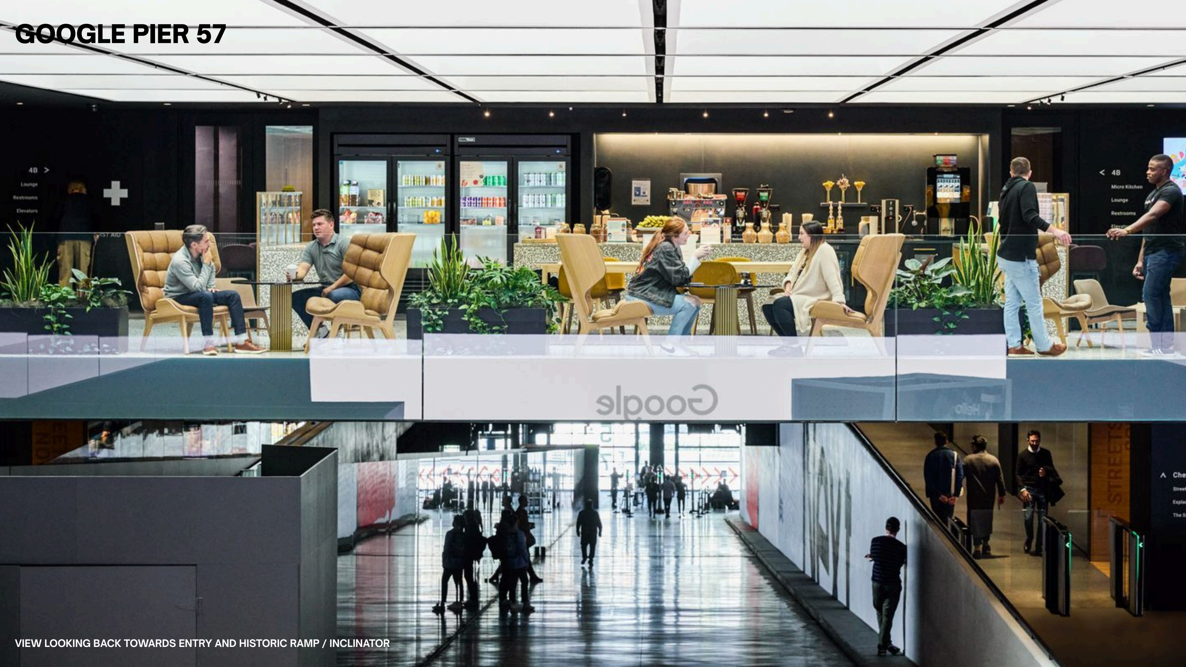
VIEW LOOKING BACK TOWARDS ENTRY AND HISTORIC RAMP / INCLINATOR