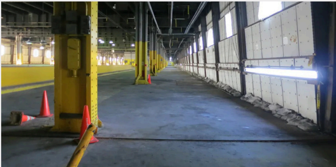
PIER 57 - PRIOR TO RENOVATION