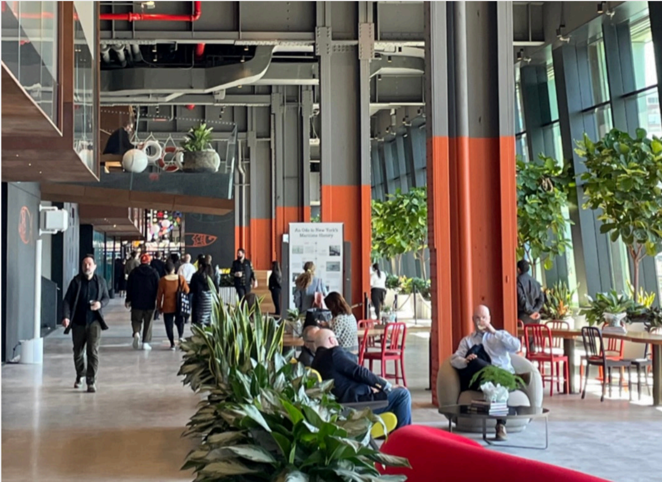
GROUND FLOOR EVENT SPACES AND PUBLIC STAIR TO ROOFTOP PARK