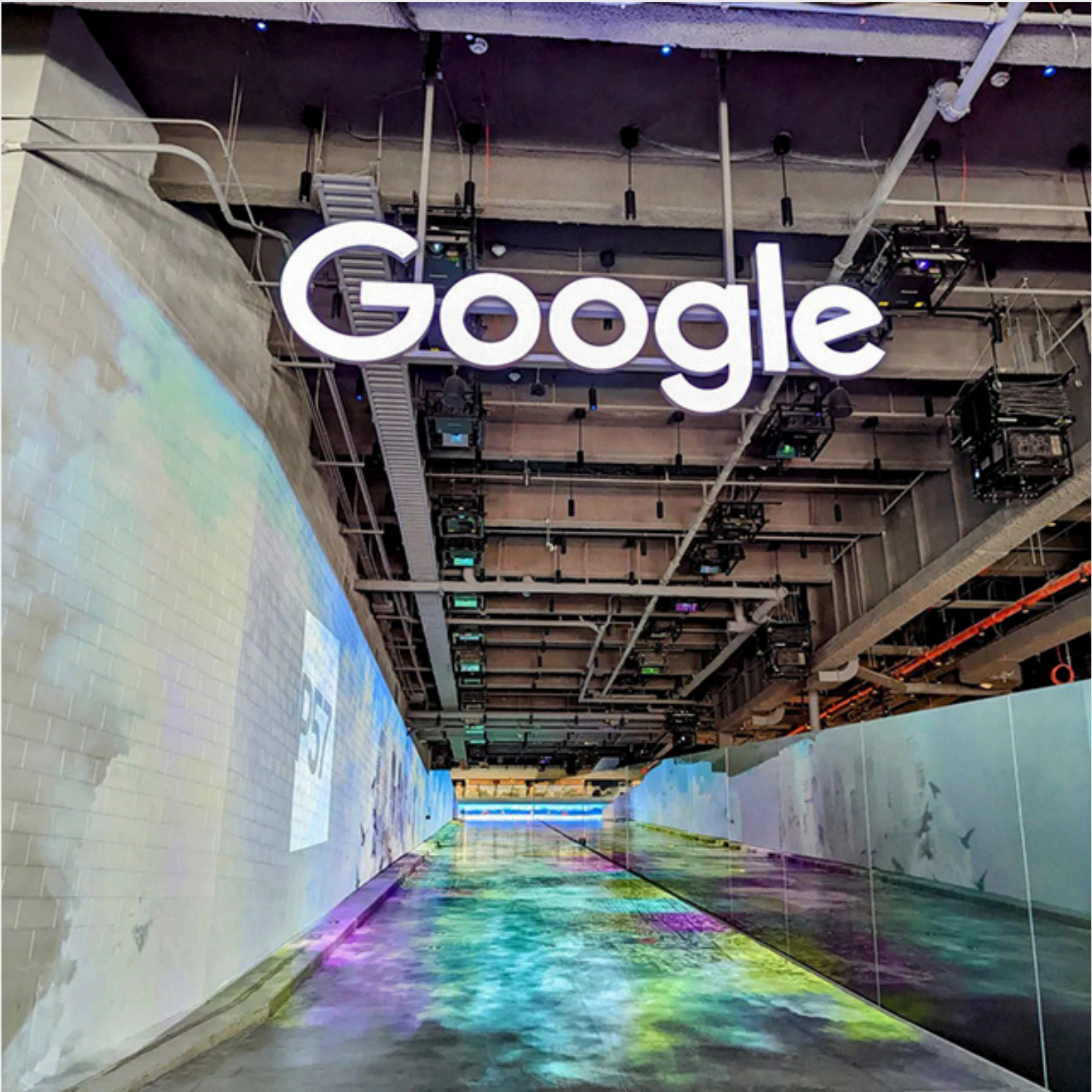
HISTORIC RAMP WITH INCLINED ELEVATOR TO GOOGLE'S VISITOR LANDING