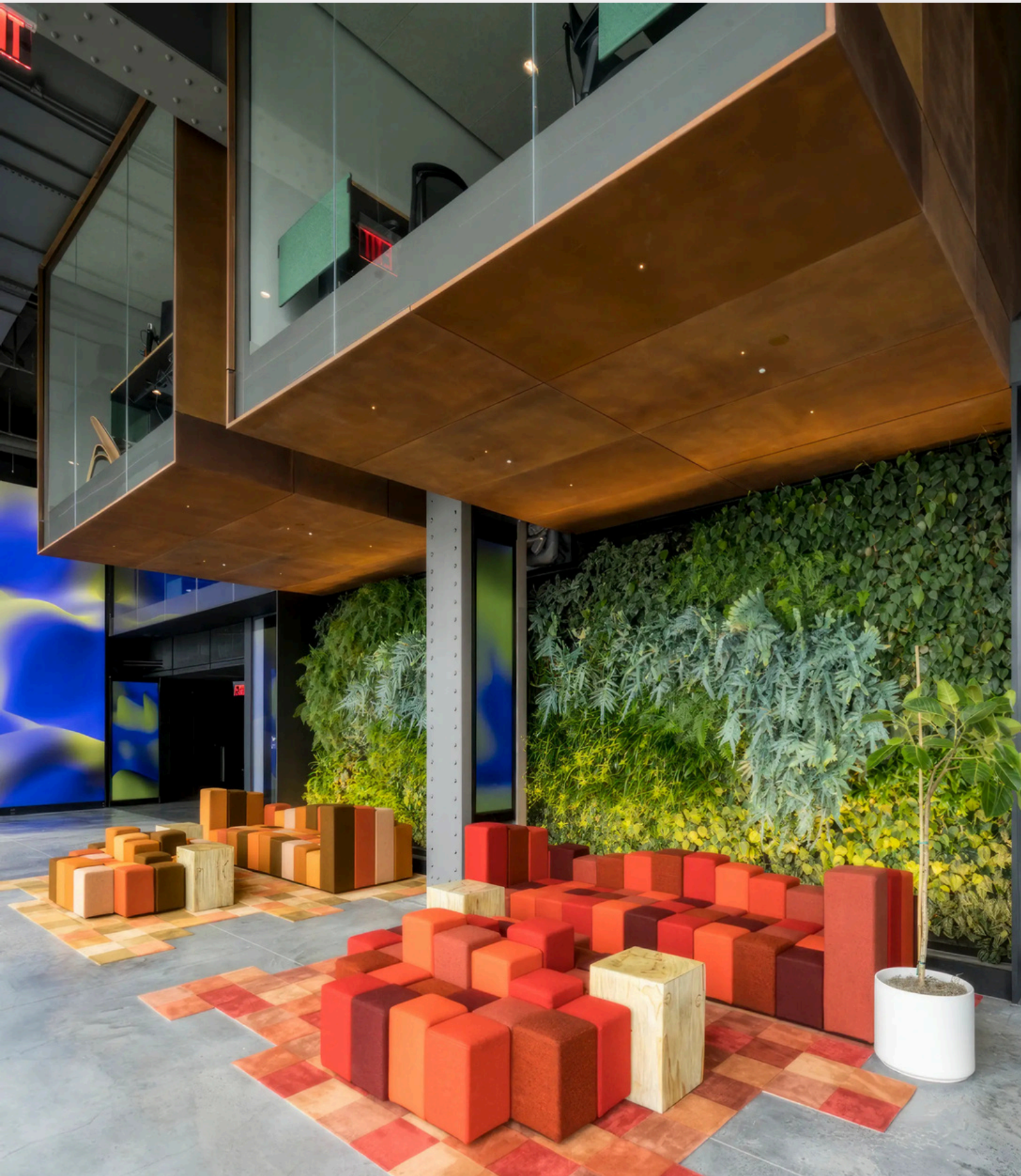
VIEW OF EAST/WEST CONNECTOR CORRIDORS WITH BREAKOUT LOUNGE SPACES