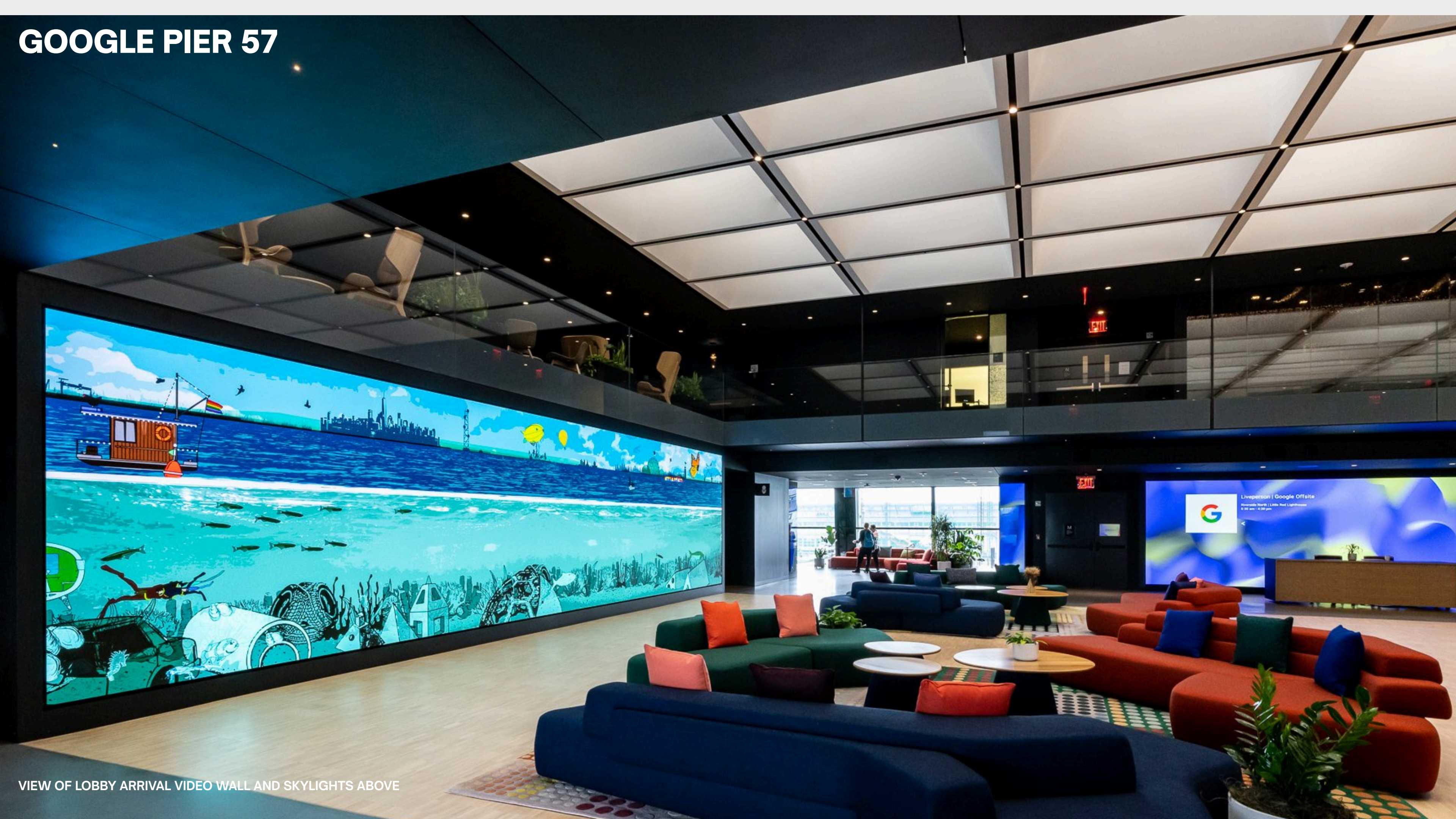
VIEW OF LOBBY ARRIVAL VIDEO WALL AND SKYLIGHTS ABOVE