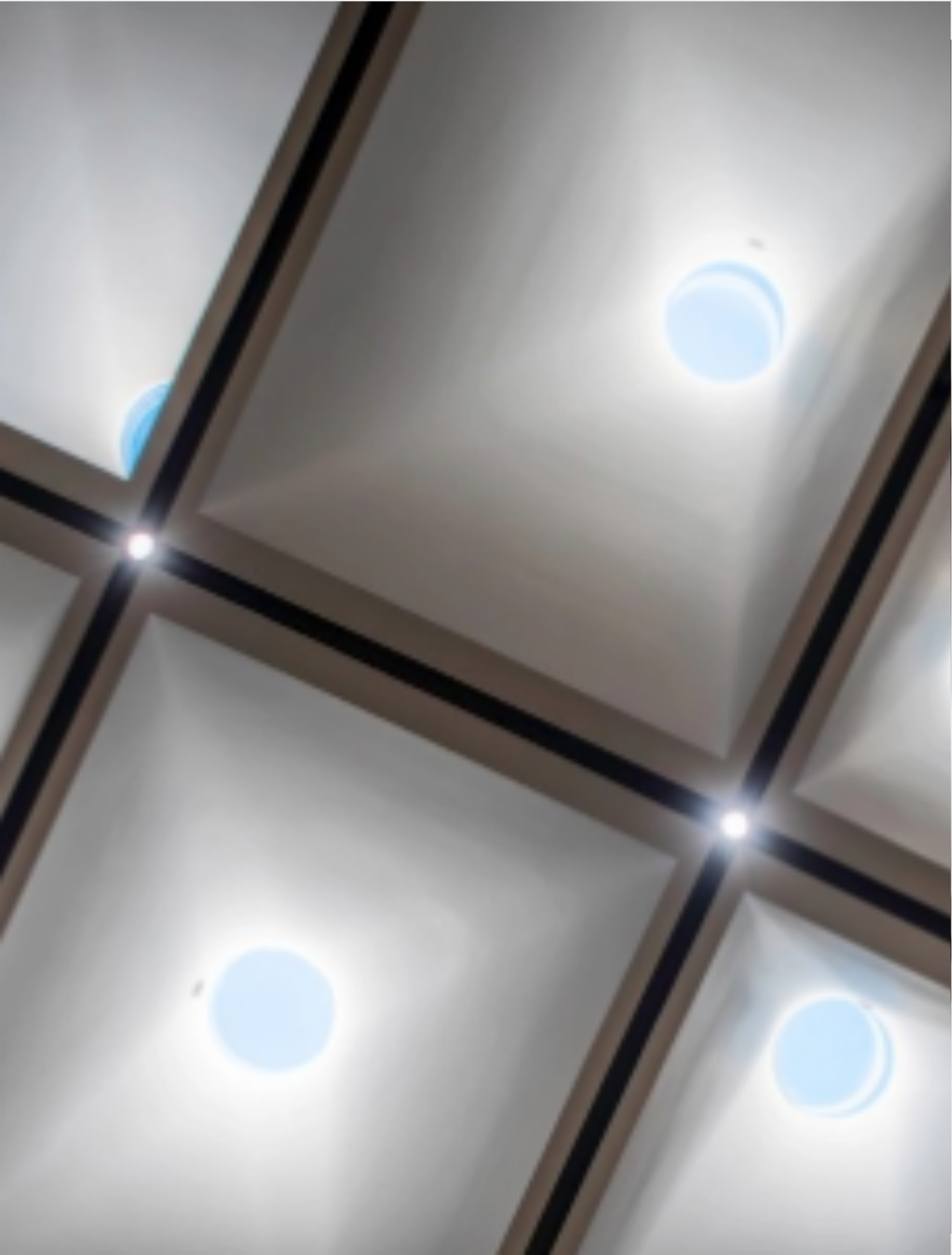
EACH SKYLIGHT TAPERS IN SECTION, ALLOWING FOR VARIOUS EXISTING STRUCTURAL, MECHANICAL AND PLUMBING CONDITIONS TO REMAIN, THIS CREATES AN ARTFUL PLAY OF LIGHT AND SHADOW THROUGHOUT THE DAY IN THE MAIN LOBBY SPACE BELOW. THE SKYLIGHTS INTERFACE WITH THE NEW ROOFTOP PARK, DESIGNED BY !MELK AND HANDEL ARCHITECTS