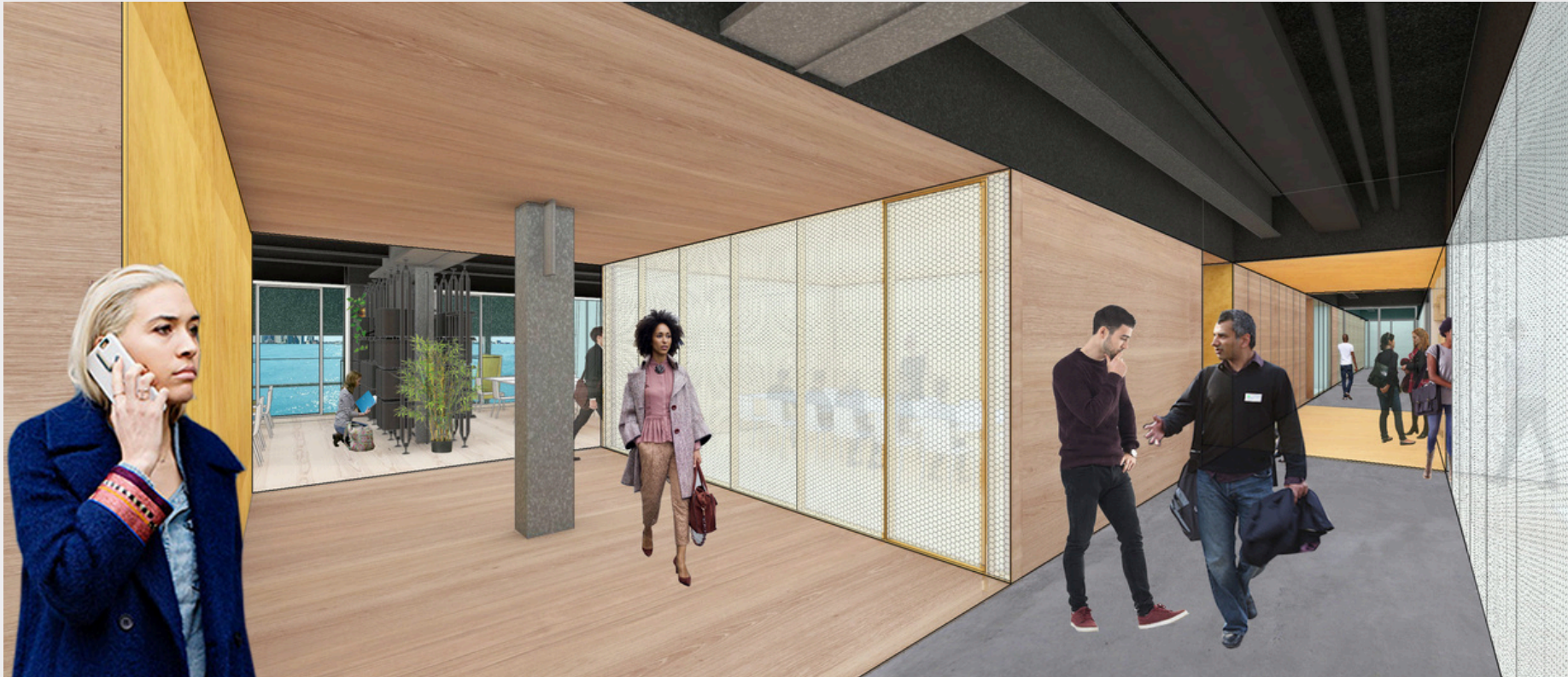
TYPICAL OFFICE MEETING SPACES