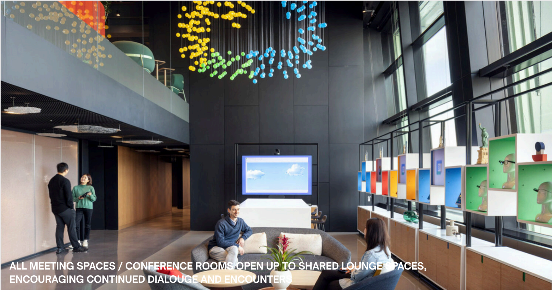
ALL MEETING SPACES / CONFERENCE ROOMS OPEN UP TO SHARED LOUNGE SPACES, ENCOURAGING CONTINUED DIALOGUE AND ENCOUNTERS