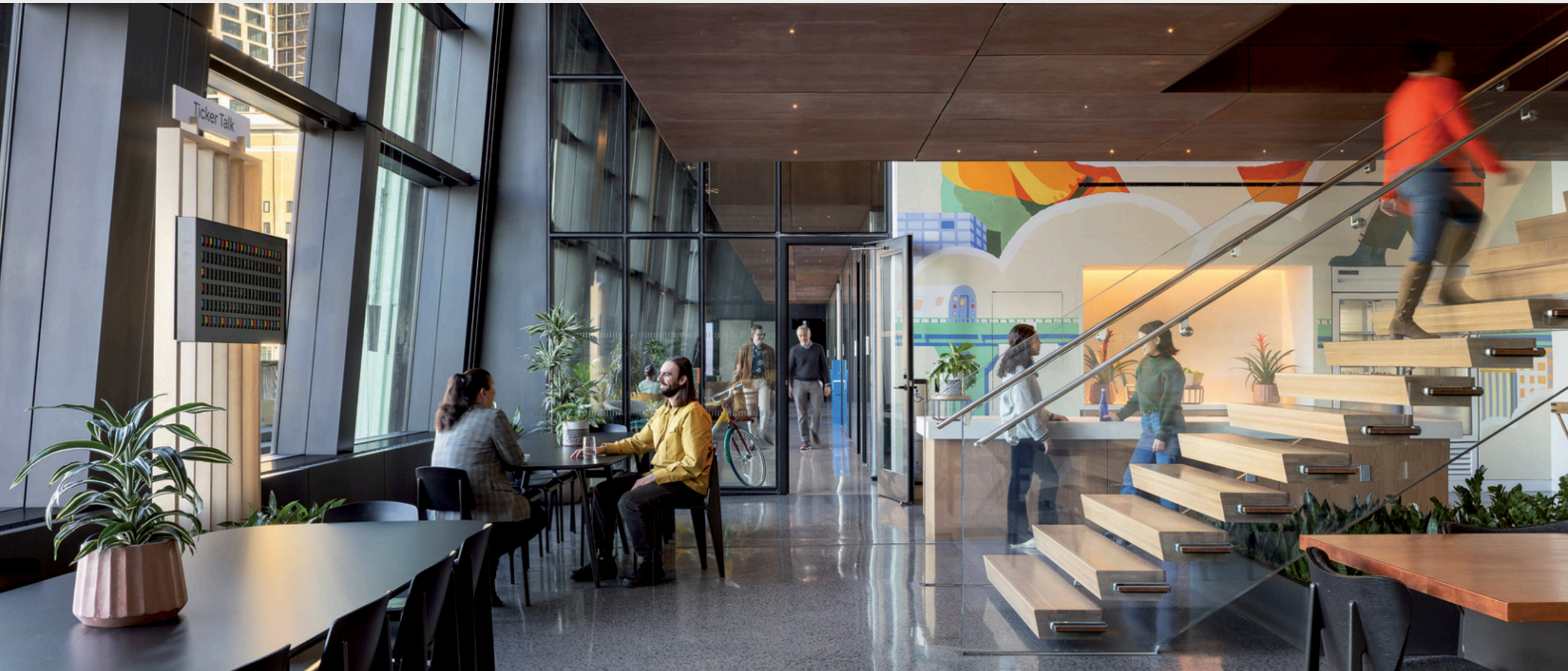
A CUSTOM DESIGNED STAIRCASE UTILIZING GLASS AS THE PRIMARY STRUCTURAL SUPPORT. CORTEN STEEL SUPPORTED TREADS PIERCE THROUGH THE GLASS STRINGERS AND ARE CLAD IN FSC-CERTIFIED WHITE OAK.