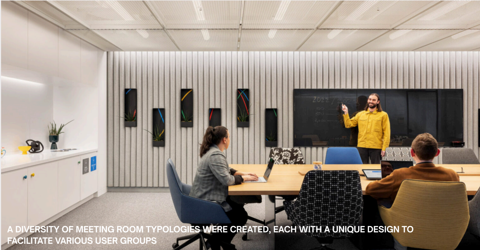
A DIVERSITY OF MEETING ROOM TYPOLOGIES WERE CREATED, EACH WITH A UNIQUE DESIGN TO FACILITATE VARIOUS USER GROUPS