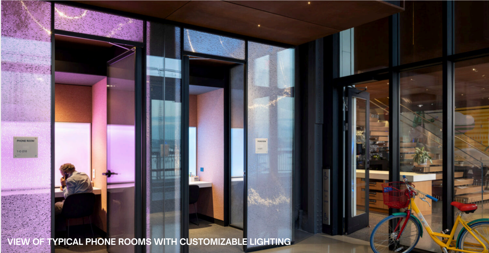
VIEW OF TYPICAL PHONE ROOMS WITH CUSTOMIZABLE LIGHTING