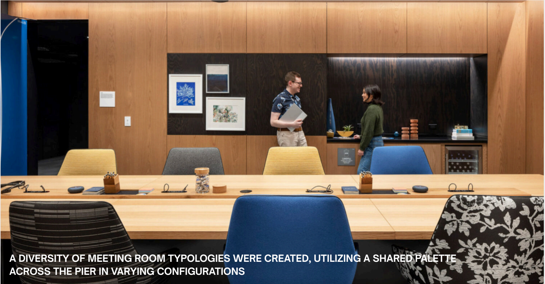
A DIVERSITY OF MEETING ROOM TYPOLOGIES WERE CREATED, UTILIZING A SHARED PALETTE ACROSS THE PIER IN VARYING CONFIGURATIONS