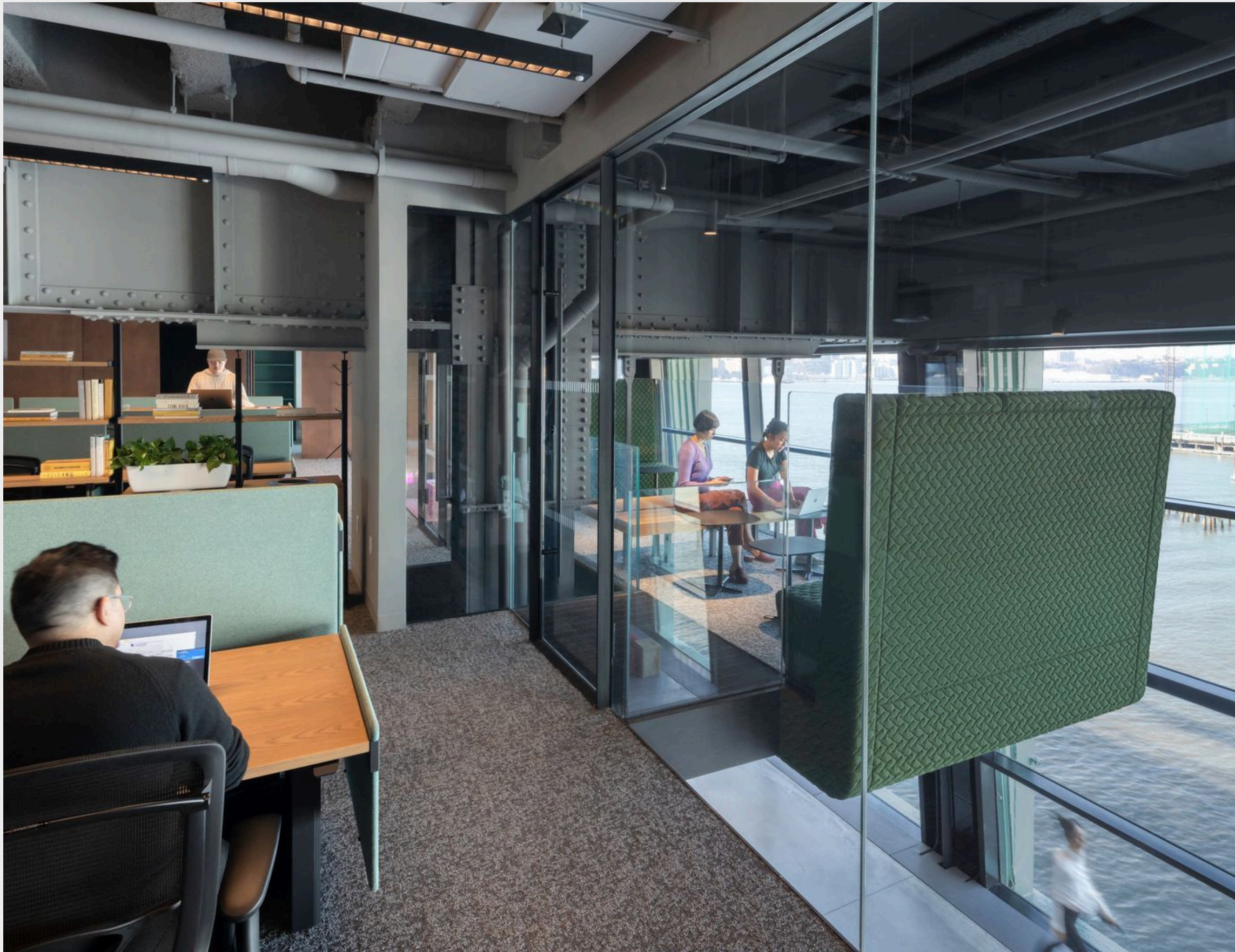
VIEW OF OPEN OFFICE SPACES WITH FLOATING LOUNGE ABOVE EAST/WEST CONNECTOR CORRIDORS