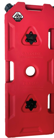
5 Gallon Model Number RJC-5