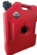
3 Gallon Model Number RJC-3