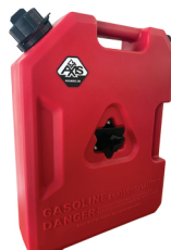
2 Gallon Model Number RJC-2