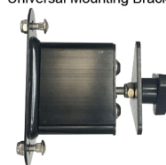
Universal Mounting Bracket

Jerry Cans are ergonomically designed with unique vehicle mounting system with user friendly universal brackets