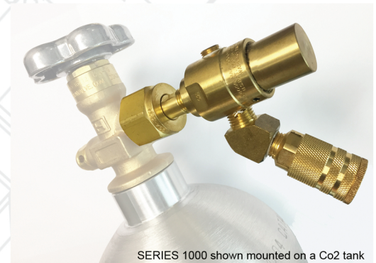
SERIES 1000 shown mounted on a Co2 tank