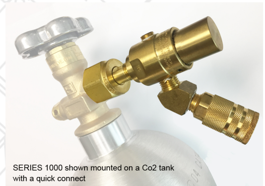
SERIES 1000 shown mounted on a Co2 tank with a quick connect