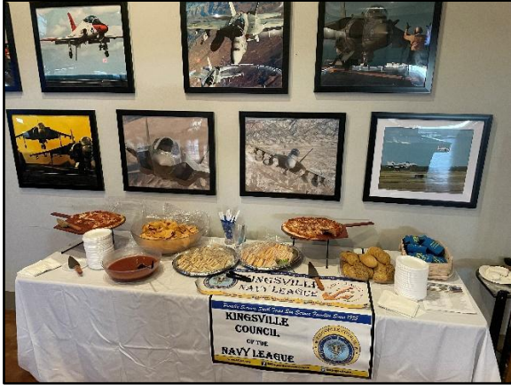
Patching Ceremony on 27Feb2025

After all that, the Kingsville Navy League still had a couple of events remaining in February. We continue to support TW-2 by providing hors d'oeuvres during the Patching Ceremonies the night before the Winging Ceremonies. Below is a picture of the food typically provided by the Kingsville Navy League for the Wingees, their families, and friends. Be sure to visit our website to see the calendar of events, including Patching and Winging Ceremonies.