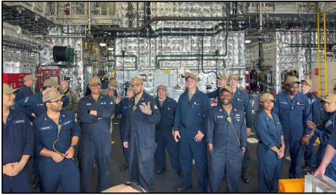
Above, Sailors onboard the USS Kingsville await their turn to indulge in the Birthday cake and punch. Thanks!