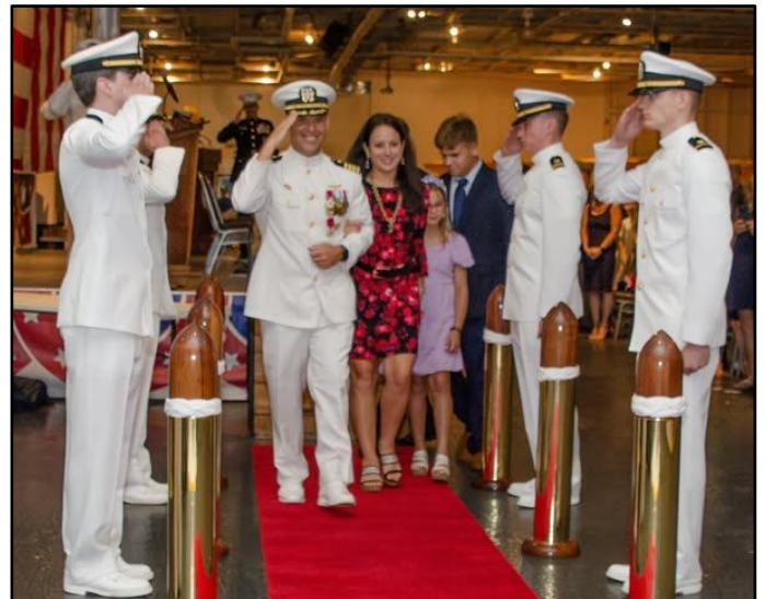
“Fair Winds and Following Seas”