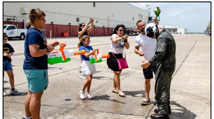
The traditional “wetting down” after the last flight.