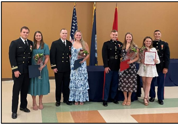
Below: A special "THANK YOU" is extended to the spouses and all family members for their sacrifice over the years.