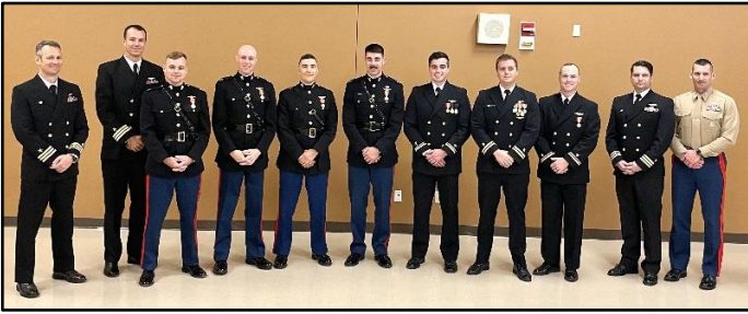
Congratulations to our newest Naval Aviators, winged on 22Nov2024. Best of Luck to all Aviators, and their families, as they join the Fleet.