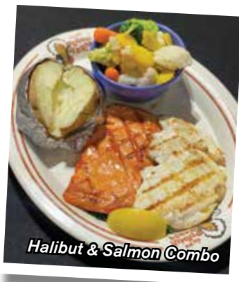
Halibut & Salmon Combo

A fillet of each, the best Alaska has to offer. Market price.