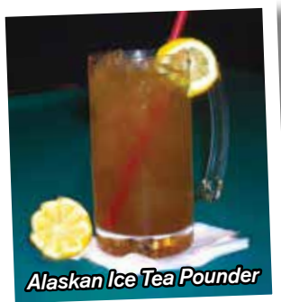
Alaskan Ice Tea Pounder

A 25 oz. powerhouse proudly made with Tito's, Bacardi, Tanqueray, José Cuervo, Triple Sec Liqueur, Sweet and Sour and Coca-Cola. *Limit two (2) per customer. $17.50 Add strawberries $1