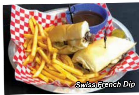
Swiss French Dip