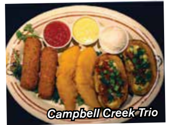
Campbell Creek Trio

Potato skins, Mozzarella sticks, and Chicken strips. $17.50 (No substitutions.)