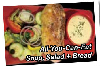
All-You-Can-Eat Soup, Salad + Bread