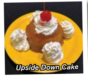
Upside Down Cake

A single serving of paradise in Alaska. $9