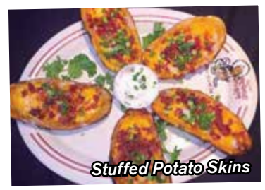
Stuffed Potato Skins

Five spuds deep fried and topped with Cheddar, bacon bits and chives. Served with sour cream. $15.75