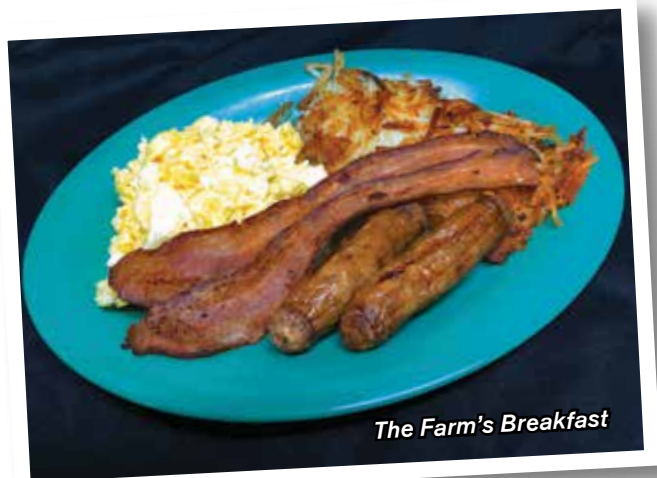
The Farm's Breakfast

2 scrambled eggs, 2 pieces of bacon, 2 sausage links and hash browns. No Substitutions! $15