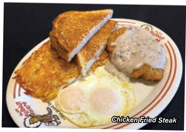
Chicken Fried Steak

2 eggs, hash browns or home fries and white or wheat toast. $19.50