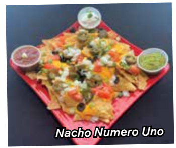
Nacho Numero Uno