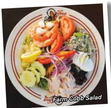
Farm Cobb Salad

Traditional Cobb salad with shrimp. $18.50