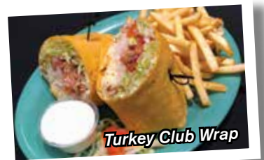
Turkey Club Wrap

Lean turkey, lettuce, tomato, bacon, avocado, Jack cheese and ranch. $16.75