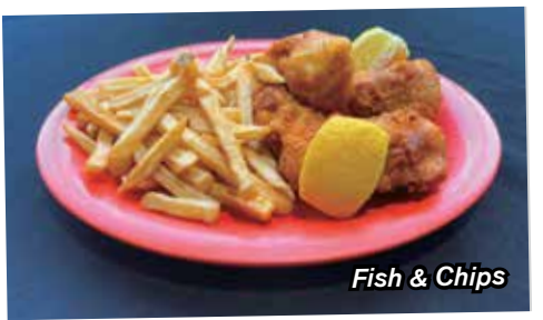
Fish & Chips

Five pieces of beer battered Alaskan halibut nuggets with tangy tarter sauce and french fries. $24