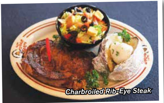
Charbroiled Rib-Eye Steak

One full pound with just a touch of seasoning. $36