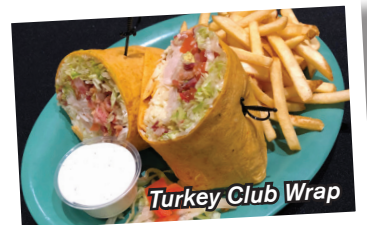
Turkey Club Wrap