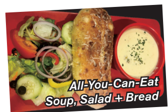
All-You-Can-Eat Soup, Salad + Bread