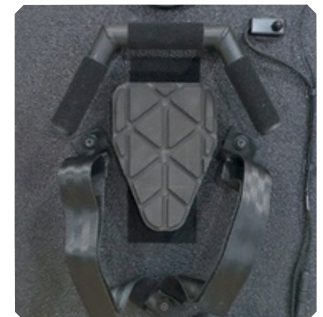
Tri-Grip Handle (Optional)