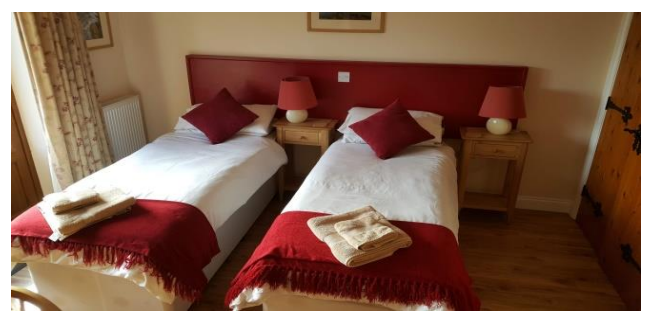
As twin beds