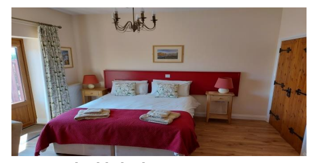
As a double bed