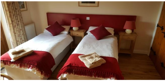
As twin beds