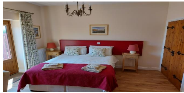
As a double bed