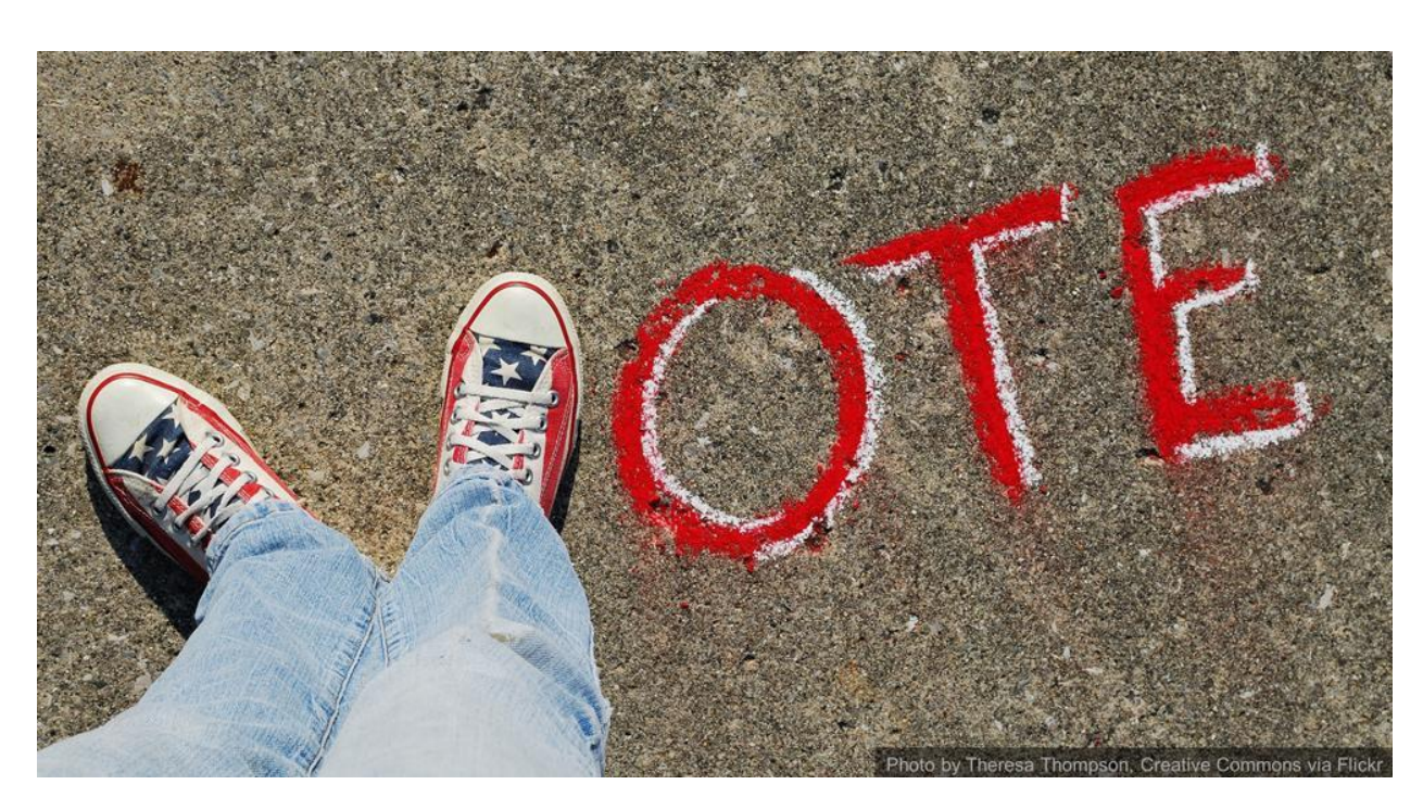
Join the League of Women Voters of San Francisco or donate to support our work: lwvsf.org