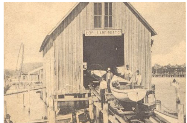
Boathouse, Titusville, Florida 1885

The first permanent settlement in present-day Brevard was established near Cape Canaveral in 1848. After the establishment of a lighthouse, a few families moved in and a small, but stable settlement was born. Gradually, as the threat of Seminole Indian attacks became increasingly unlikely, European Americans began to move into the area around the Indian River. In the 1850s a small community developed at Sand Point, which eventually became the city of Titusville. Unlike other areas of Florida, the American Civil War had little effect on Brevard County, other than perhaps to slow the movement of settlers to the area.