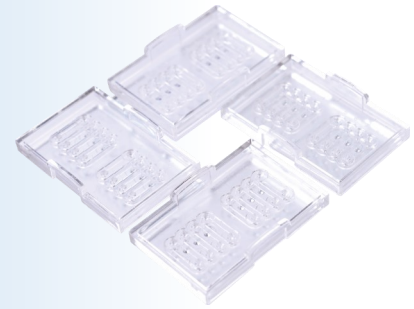
Rapi:Chips (not included)

The portfolio of SMARTCHEK foodborne pathogen detection kits cover these major foodborne pathogens.